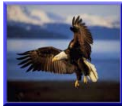
A Symbol of Protection

The First American Eagle Protection Policy - It covers more than you can imagine.