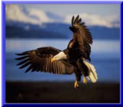
A Symbol of Protection

The First American Eagle Protection Policy - It covers more than you can imagine.